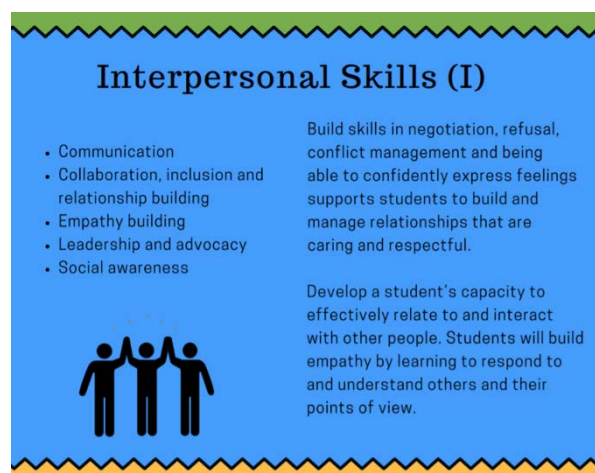
PDHPE syllabus domains

The focus K-6 in this fortnightly cycle (Feb 20-27) is on the following key inquiry questions: