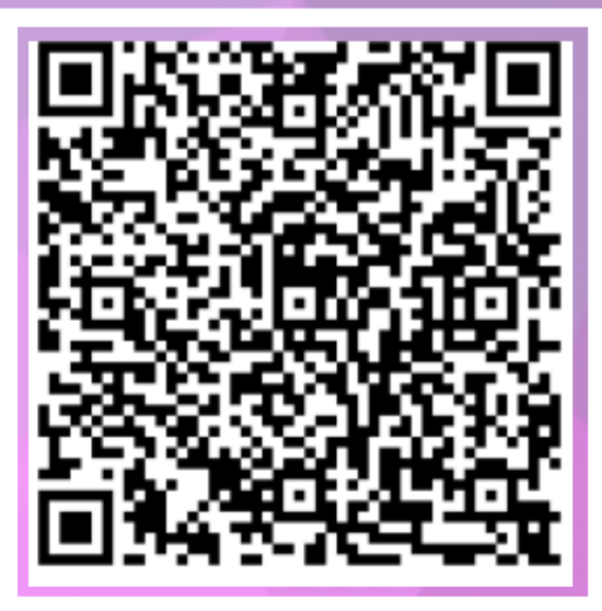
6S Writing samples

Scan these QR codes using the code scanner on your Seesaw App to see our work samples!