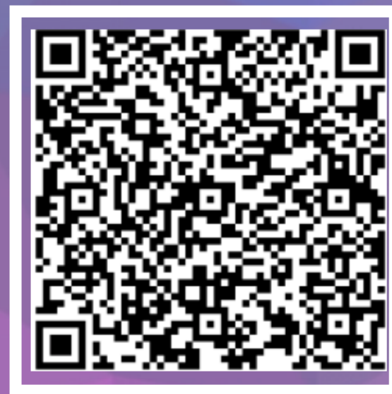
6S STEM Projects