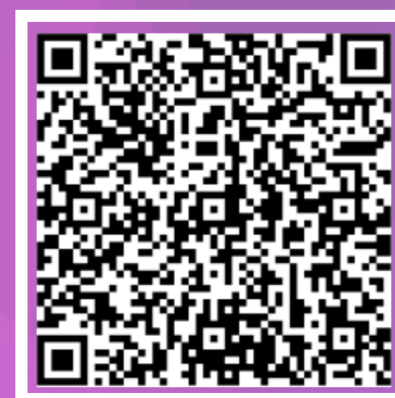
6M STEM Projects